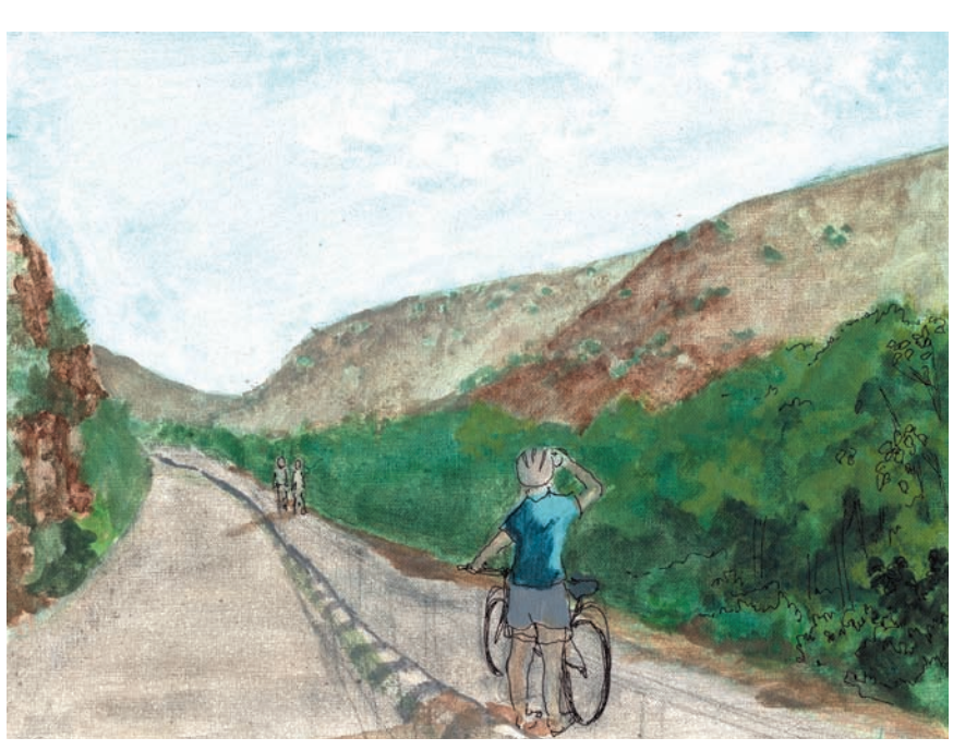
Mission Trails Regional Park