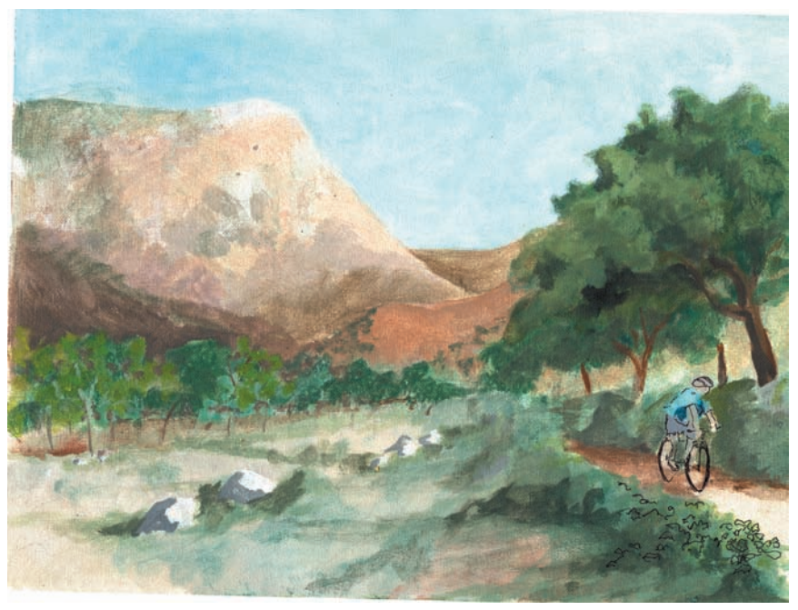
Reservoir to 67 Freeway

Arriving at the wide open vistas of the estuary with expansive views of parks and beaches the trail leads along the river's edge to its final destination at the Pacific Ocean.