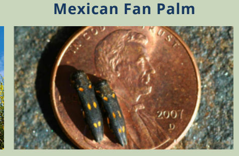
Gold Spotted Oak Borer